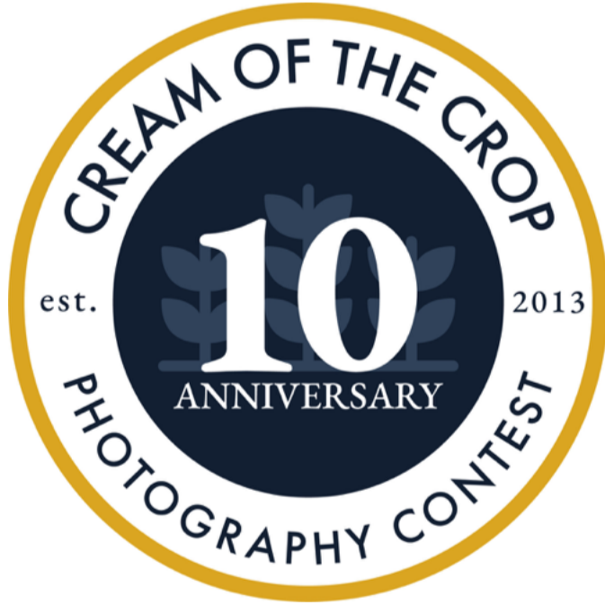
Photo Deadline is June 22